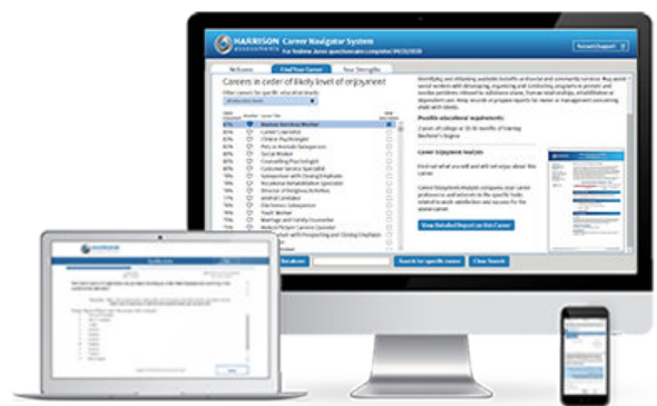
Online Interactive Career Portal